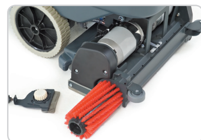
Tools-free removable brushes can be easily changed.