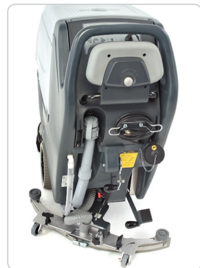
Easy access rear-port features include the solution tank fill, a large recovery drain hose with pinch-flow regulation, and the solution drain hose which also functions as a solution level indicator.