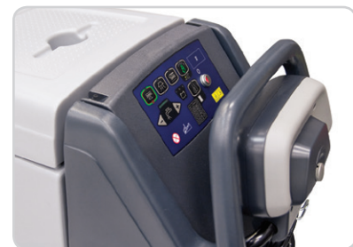
A wrap-around safe paddle system makes it easier to control and maneuver the machine.