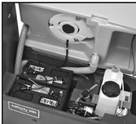
Access to batteries and EcoFlex onboard dispensing system.