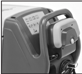
Ergonomic and safe paddle system for operator comfort.