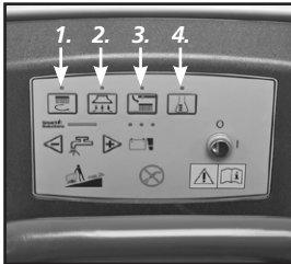
Easy to use control panel.