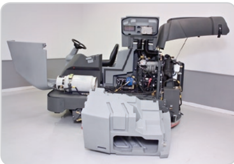
MaxAccess design provides 360 degree access to machine components.