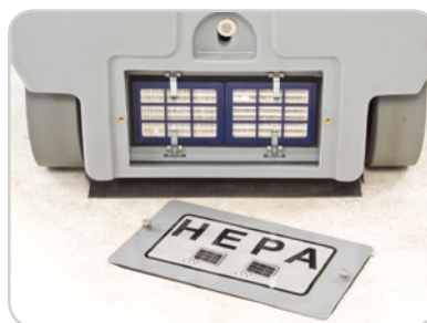
Dual H.E.P.A. filters are easy to access.

Vacuuming large, carpeted areas doesn't have to be a mountain to climb. The Advance VacRide gets the job done faster, reduces operator fatigue and provides unmatched vacuum performance on a rider platform.