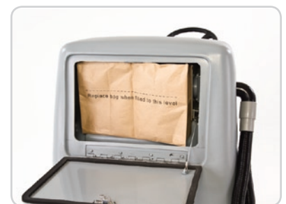
The large dust bag compartment is easy to access and has storage for an extra bag.