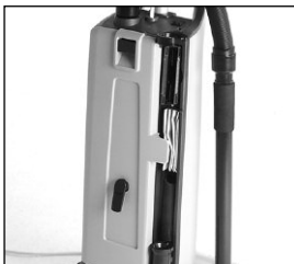
Accessories are conveniently tucked behind the vacuum wand