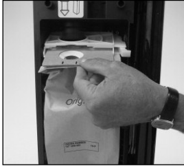
Quick change bag is the first level of filtration