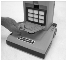
Certified H.E.P.A. is the final filtration stage