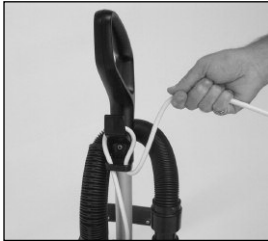
Cord restraint protects against cord abuse