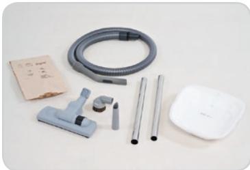
Includes six dust bags and dry basket filter for bag less operation.