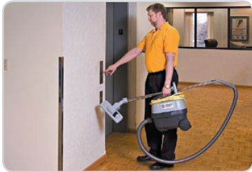
Easy transport with center handle and lightweight design.