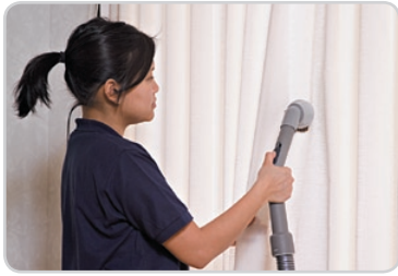
All tools mount on tube or wand for versatile cleaning.