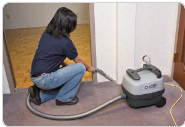
Superior edge cleaning and detail work with our top of the line crevice tool.