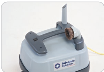
Onboard tool and cord storage.