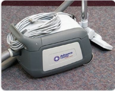
The coiled up cord is conveniently stored on top of the machine under the handle.