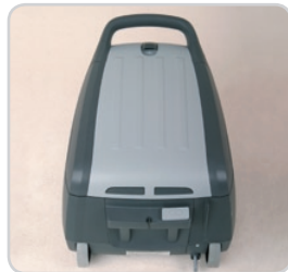
Low profile wedge shaped design maneuvers easily around obstacles.