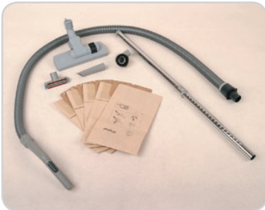
Telescopic wand and accessories make cleaning a multitude of surfaces quick and easy.