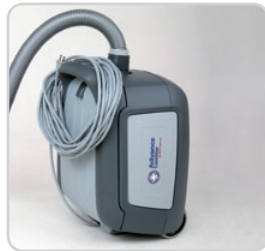
Stands on end for cleaning stairs and compact storage.