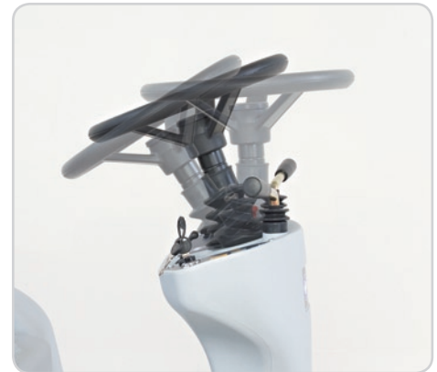
With an adjustable steering column, and heel and toe pedals for directional control, the rider sweeper provides ergonomic and safe operation.