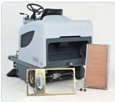
A tools-free dust filter contains a baffle system to filter out larger particles and extend life of the panel filter. A large four-sided steel debris hopper includes transport dolly wheels for ease of use and operator safety.