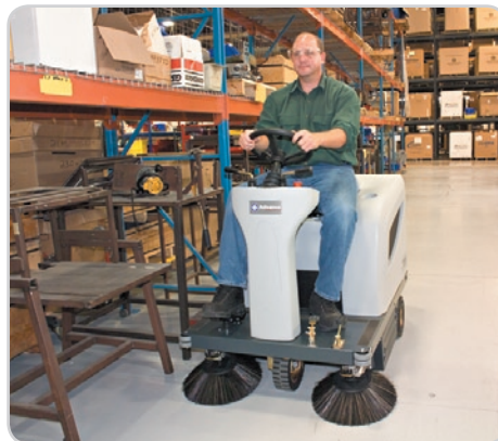
Superb maneuverability and tight turning radius permits cleaning in narrow, congested areas. Perfect for department cleaning.