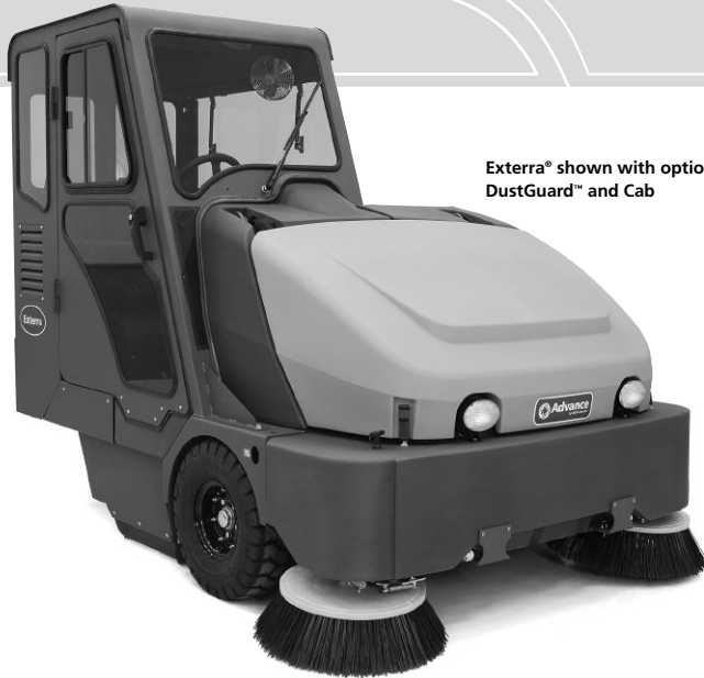
Exterra® shown with optional DustGuard™ and Cab