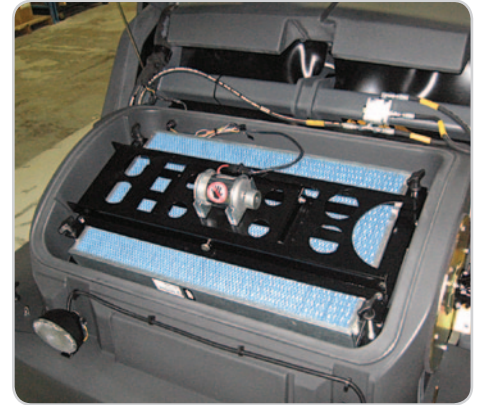
Ultra-Web® dust filter is >98% efficient on 0.3 - 1 micron dust. This meets MERV 13 on the ASHRAE 20 point scale.