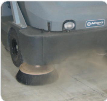
DustGuard™ suppresses side broom generated dust increasing dust controlled productivity by up to 71%.