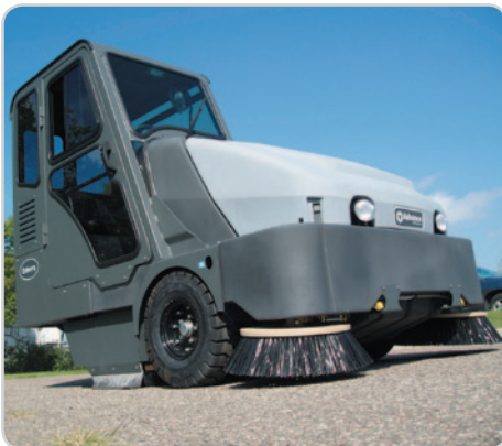
The optional all weather cab keeps the operator comfortable and productive. Clear-View™ window in the cab provides a safe view of the right side broom.