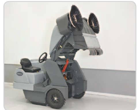
For optimal safety, the operator controls the hopper safety arm from the seat. The sweeping systems automatically shut down when the machine stops.