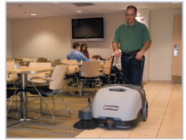
Terra® 28B easily cleans both hard and soft floors without having to change brooms