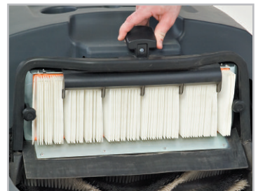
Filter shaker easily combs filter for cleaning. A well maintained filter will last for over 100 hours of operation