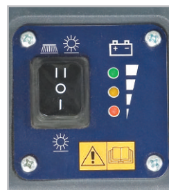
Two position, single button operation