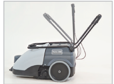
Adjustable handle folds for easy storage