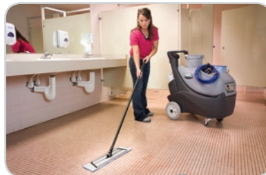
Swivel mop heads enable mopping of all areas

Advance's Micro Cleaner and All Cleaner answer the call for an affordable, touch-less approach to cleaning restrooms and other areas with hard surfaces. You'll improve productivity and see better results – now that's smart cleaning.