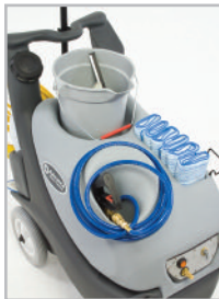
Micro Cleaner™ has storage for standard accessories