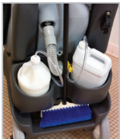
Universal chemical bottle storage

Drain hose is recessed to prevent damage