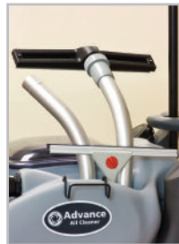
Standard accessories are easily stored on machine