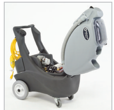
Clam shell design for easy access to the component pallet