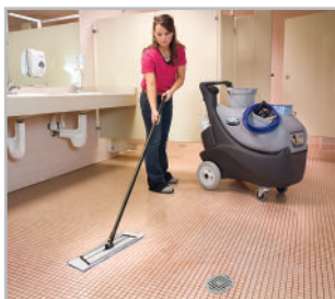
Swivel mop heads enable mopping of all areas.