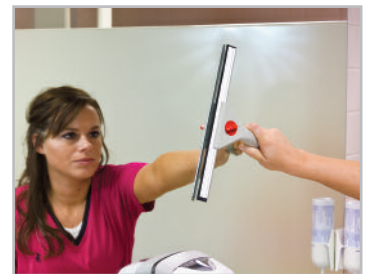
All surfaces are easily cleaned after initial spray down