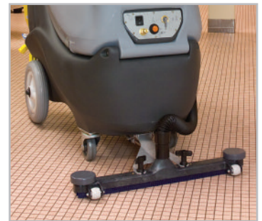
Optional front mount squeegee for easy water pick-up