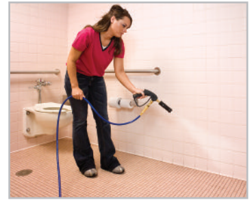
The spray gun makes dirt removal easy in hard to reach areas and allows for quick rinsing of surfaces