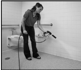
The spray gun makes dirt removal easy in hard to reach areas and allows for quick rinsing of surfaces