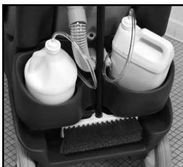
Universal chemical bottle storage