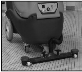
Optional front mount squeegee for easy water pick-up