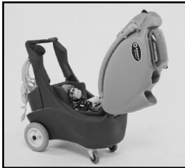
Clam shell design for easy access to the component pallet