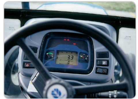
Comfortable command compartment with all the controls at your fingertips