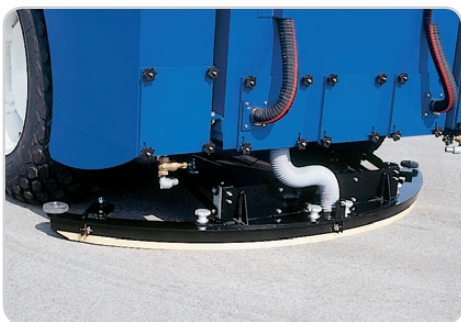
Parabolic squeegee provides superior water pickup even during the tightest turns