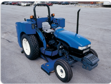
New Holland TN-60 tractor provides a proven long life platform for the scrubber