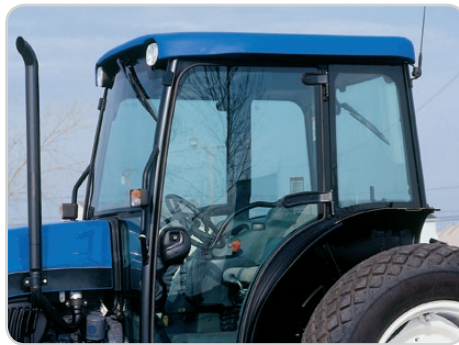
Cab version offers air conditioning, heater, front and rear windshield wipers, electronic instrument panel and 16 manual gear forward / 16 gear reverse transmission