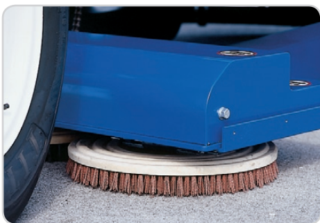
Scrub brushes with 600 pounds of downward pressure provide the most aggressive cleaning possible