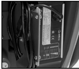
Standard onboard battery charger for wet or gel battery packages.