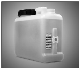
Available with AXP™ Onboard Detergent Dispensing System.