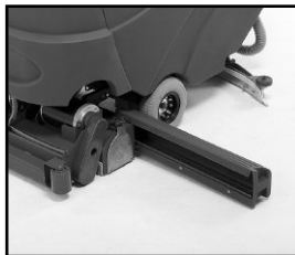
Cylindrical scrub decks sweep and scrub in a single pass with dual counter-rotating brushes. Polyethylene hopper eliminates corrosion.