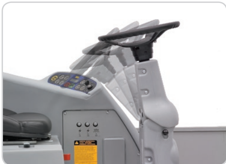
Ergonomic command compartment with tilt steering allows for easy boarding.