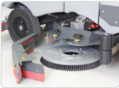
A large range of interchangeable disc and cylindrical scrub deck options provide the right tools for the specific job.

The Condor's unique traction control system maximizes drive wheel grip and improves overall safety while its One-Touch™ scrubbing controls minimize operator training and increase cleaning performance.