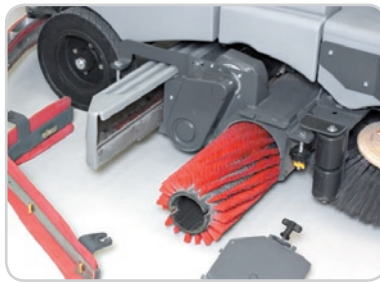
A large, non-corrosive hopper on cylindrical models allows for maximum debris capacity without overflow and slides out for easy debris disposal.