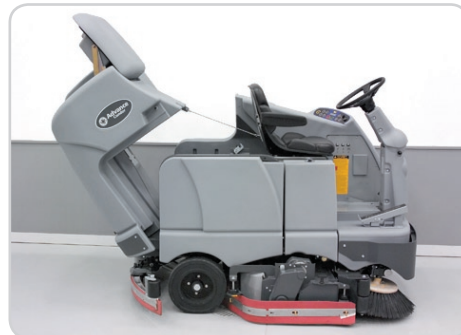
No tools are needed to lift off recovery tank for extra access to batteries and squeegee assembly.