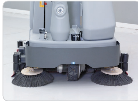
Retractable side brooms on cylindrical models sweep debris away from pallets and walls.