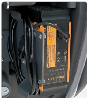
Standard onboard battery charger for wet or gel battery packages.

Indicates Max Solution Flow Indicates Max Scrub Pressure Push and hold Scrub Button for 5 seconds for Extreme Scrub setting