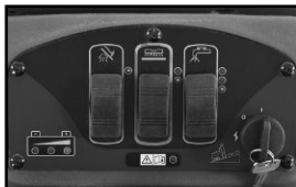
The ST 26 inch disc model – provides simple operation and robust scrubbing controls.