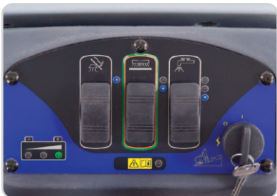
The ST 26 inch disc model – provides simple operation and robust scrubbing controls.