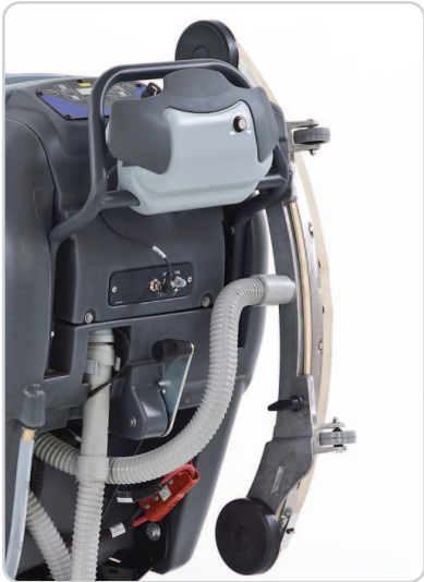
A built-in squeegee hanger makes transport easier and reduces trip and fall accidents.