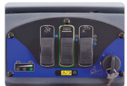
The SC 750 ST – provides simple operation and robust scrubbing controls.