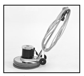
The 50 foot cord is nonmarking safety yellow colored