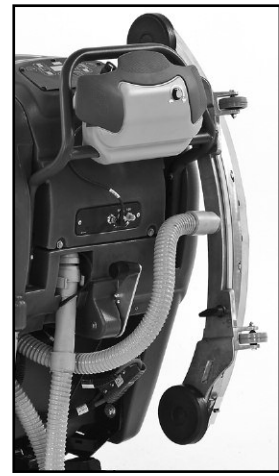
A built-in squeegee hanger makes transport easier and reduces trip and fall accidents.