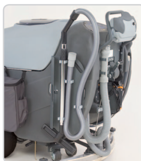
Onboard Scrub-Vac System

14600 21st Avenue North Plymouth, MN 55447-3408 www.advance-us.com Phone 800-214-7700 Fax 800-989-6566