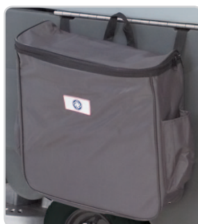
Onboard Tote Bag