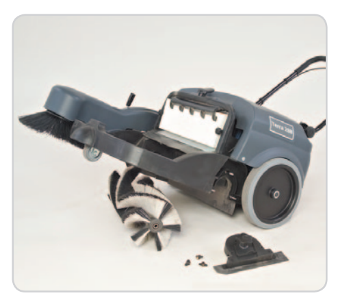
Tools-free removal of brooms and hopper makes for easy maintenance