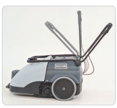
Adjustable handle folds for easy storage