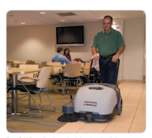
Terra® 28B easily cleans both hard and soft floors without having to change brooms