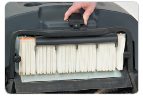
Filter shaker easily combs filter for cleaning. A well maintained filter will last for over 100 hours of operation

*Based on productivity numbers published by the International Sanitary Supply Association (ISSA)