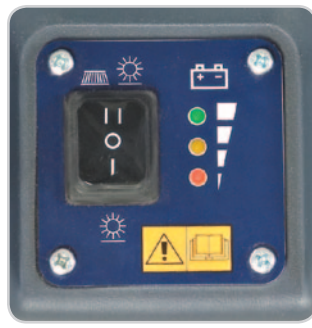
Two position, single button operation