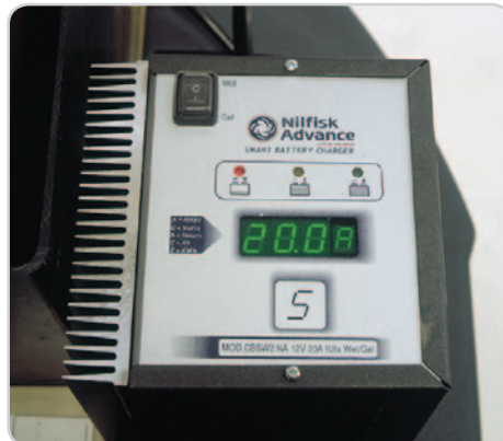
Convenient onboard charger provides flexibility to charge at anytime, anyplace.