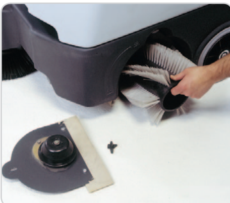
Main broom easily removed and replaced without the use of tools.