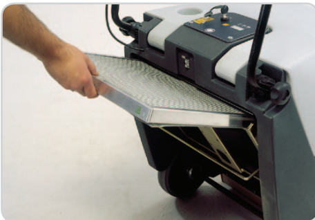
Two stage dust control system for more effective dust control. Access filters without tools.