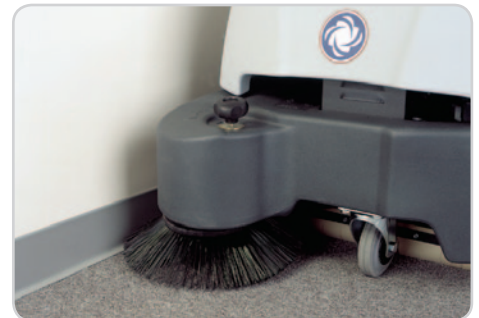
Excellent edge cleaning results from the side broom. Eliminates secondary edge cleaning operation common with vacuuming.