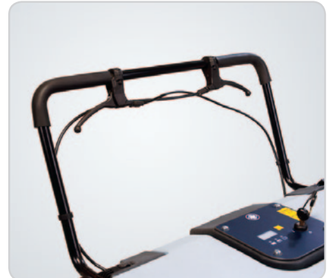
Ergonomic, height adjustable handle design with conveniently located controls for safe and easy use by the operator.