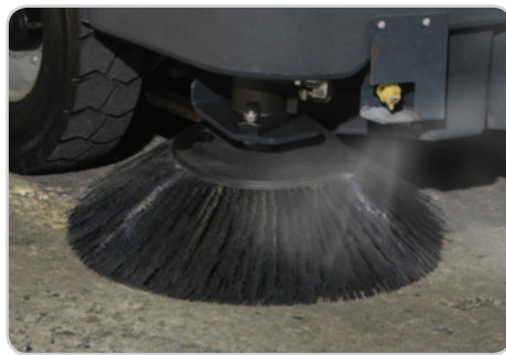
DustGuard™ suppresses airborne fugitive dust where most dust is generated – at the side brooms