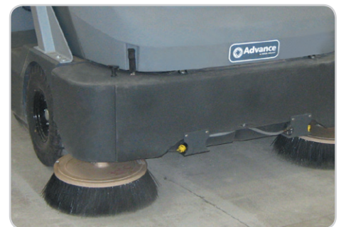
Sweeping with DustGuard™