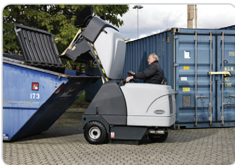
Variable dump height of up to 62 inches allows fast and simple disposal of swept debris