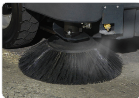
DustGuard™ suppresses airborne fugitive dust where most dust is generated – at the side brooms