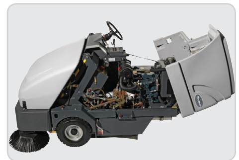
MaxAccess™ allows faster repairs and less downtime so the sweeper spends less time in the shop and more time sweeping