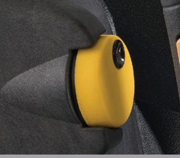
Conveniently located thumb controlled cruise control increases productivity and safety.