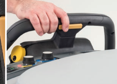
A single reverse button for control, safety and ease of use.