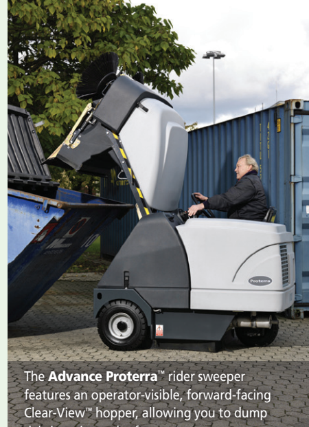
debris easier and safer.