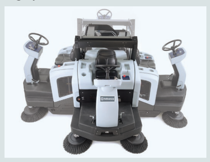
Front steering and front wheel drive with tight turning radius.