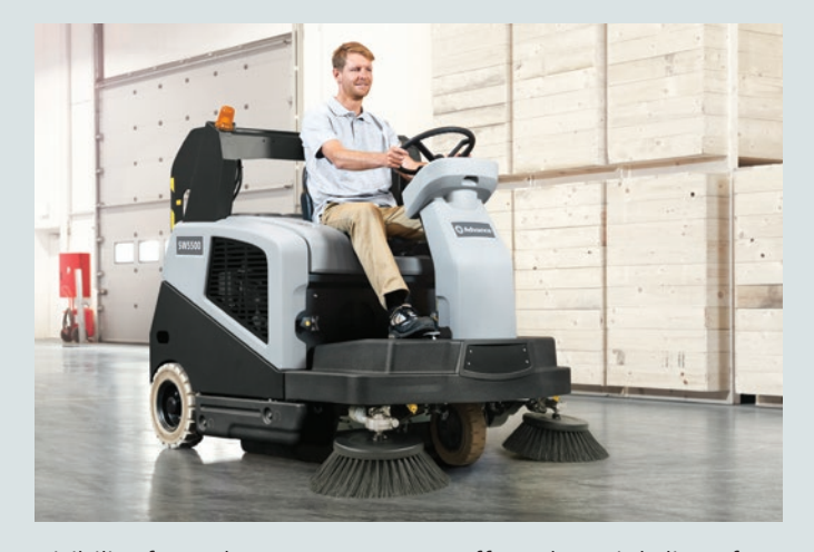
Visibility from the operator's seat offers clear sightlines for greater safety and consistent edge cleaning.