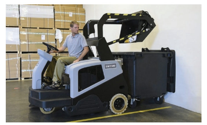
Compact overthrow design with direct throw sweeper performance.