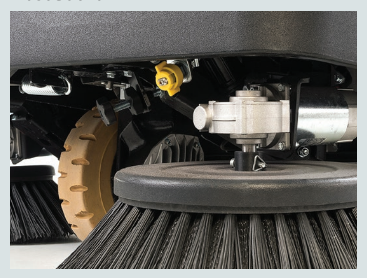
DustGuard™ minimizes fugitive dust generation and provides optimal sweeping performance.