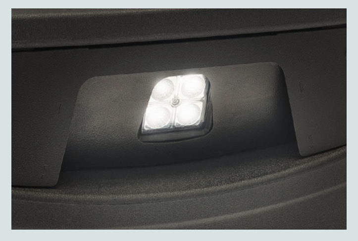
Bright LED headlights provide greater visibility in dimly lit environments.