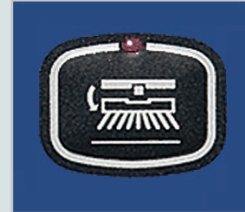
Pad drive click-off