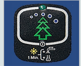
EcoFlex™ System "burst of power" mode