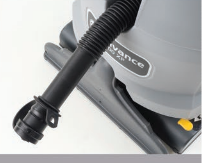
he front-mounted nozzle makes dumping nuch faster and easier for the operator.