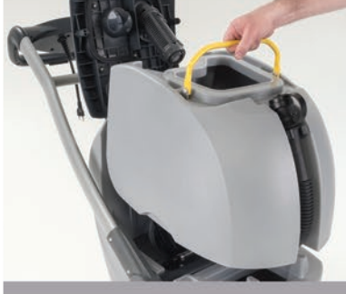
The removable, increased capacity tank along with the stowable handle make refilling much simpler.

Simply flip a switch to easily shift from spotting to extraction mode.