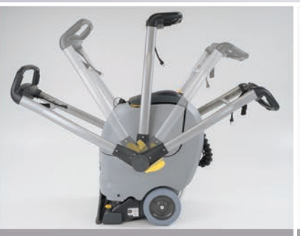
An adjustable handle allows for easy maneuverability, decreasing the need for backing into tight spaces. (ES400<sup>™</sup> XLP shown)