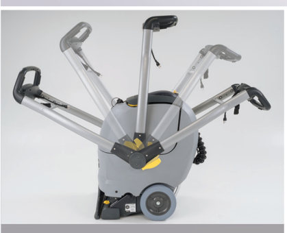
An adjustable handle allows for easy maneuverability, decreasing the need for backing into tight spaces. (ES400™ XLP shown)