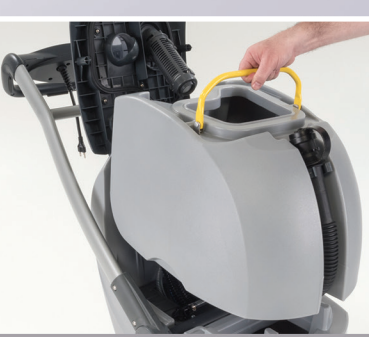
The removable, increased capacity tank along with the stowable handle make refilling much simpler.