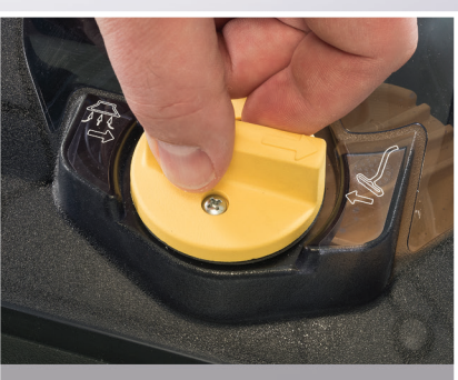
Simply flip a switch to easily shift from spotting to extraction mode.