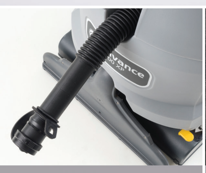
The front-mounted nozzle makes dumping much faster and easier for the operator.