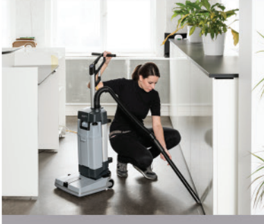
Optional manual suction hose offers the ability to reach less accessible areas.