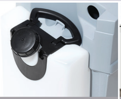
Solution tank dispenses only clean solution, unlike a traditional mop-and-bucket.