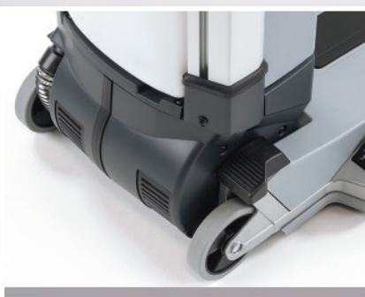
Machine functions stop when in the upright position.