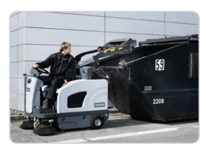
High hydraulic dump enables fast dumping. The retractable hopper minimizes machine length to provide best-in-class maneuverability.