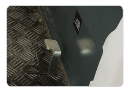
To ensure larger lightweight debris is captured in the hopper, operators can activate the large debris pedal.