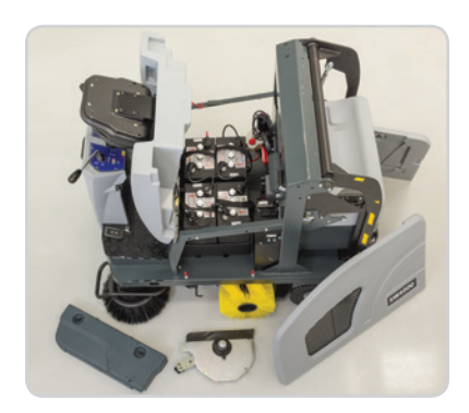
The SW4000™ offers MaxAccess with tools-free side cover removal for full access to the battery compartment and main broom drive components.