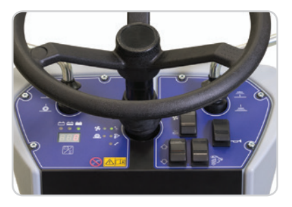
The SW4000™ offers One-Touch™ sweeping with a single switch. Integration with the drive pedal ensures and minimizes broom wear and maximizes run-time.

Durable side brooms feature impact resistant flexible mounting and protection using rugged steel guards