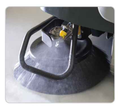
The optional DustGuard™ misting system provides up to 75% greater dust controlled sweeping path for superior indoor air quality and maximizes sweeping efficiency.