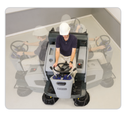
Front-wheel powered and steered drive wheel provides superior maneuverability, allowing operators to sweep in tight corners or narrow aisles