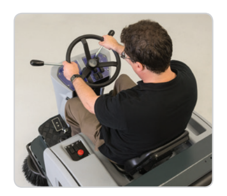
Clear-View<sup>™</sup> enhances operator safety.