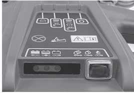
Electronic solution control for low, medium and high flow.