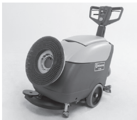
Brush stored on front for ease of transport.