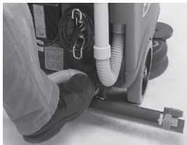
Foot-activated squeegee lift for easy operation.