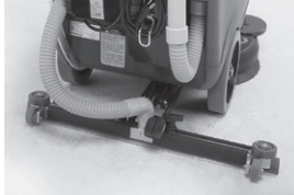
Center-pivot squeegee system employs a gas spring for maximum blade pressure to ensure complete dirty solution pickup in both forward and reverse.