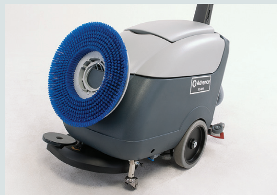
Brush stored on front for ease of transport.