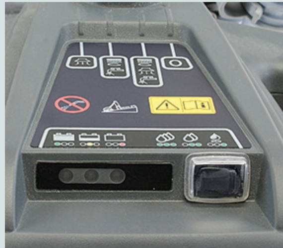
Electronic solution control for low, medium and high flow.