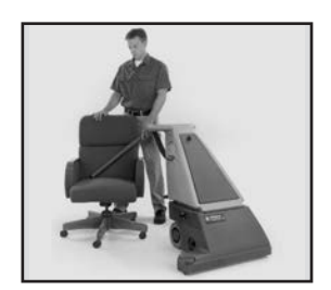
Built-in hose and wand is perfect for quick, off-thefloor clean-ups on steps or furniture.