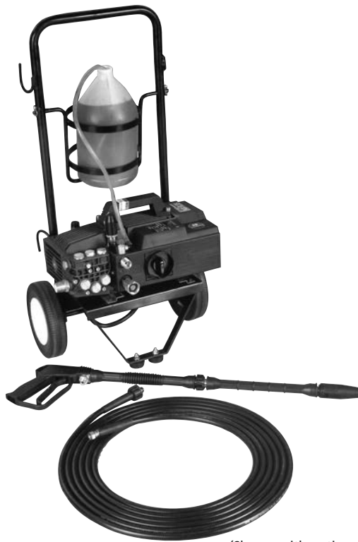
(Shown with optional transport cart)