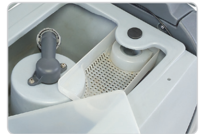
An integrated debris catch cage traps and collects drain clogging debris.