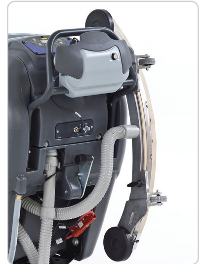
A built-in squeegee hanger makes transport easier and reduces trip and fall accidents.