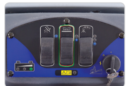
The SC750 ST / SC800 ST – provides simple operation and robust scrubbing controls.

* Onboard charger available on SC800 models only.