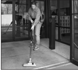
Combination floor tool is easy to use on hard or soft floors.