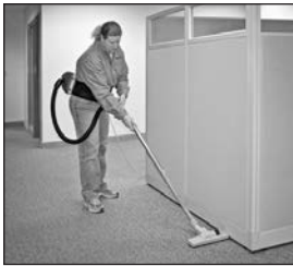
Edge cleaning is done easily with the Adgility™.