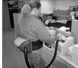
Detail cleaning on the go is easy with handy crevice tool and bristle brush.