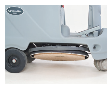
Mid-mounted, burnishing head tilts up for access to change burnishing pads quickly and easily.