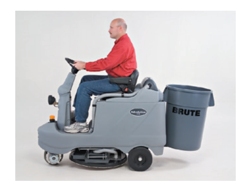
Equipped with optional accessory kits, the Advolution™ 2710 becomes multi-functional.