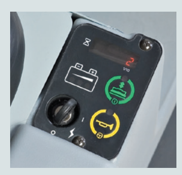
Simple, One-Touch™ operators button.

Operators of the Advolution 2710 rider burnisher can expect uncompromised safety. Open sight lines in front of the machine create a safe and comfortable ride for the operator. Automatic safeguards eliminate unmanned start-ups, which can lead to damaged floor finish. A safety switch prevents accidental pad start-up in the tilt-up position. Passive dust control is standard on the Advolution 2710 rider burnisher, which reduces the need for dust mopping. An active dust control kit is available as an option for environments that require a higher degree of filtration.