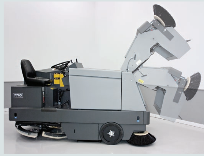
All-steel, 16 cubic foot debris hopper has a variable 60 inch dump system.