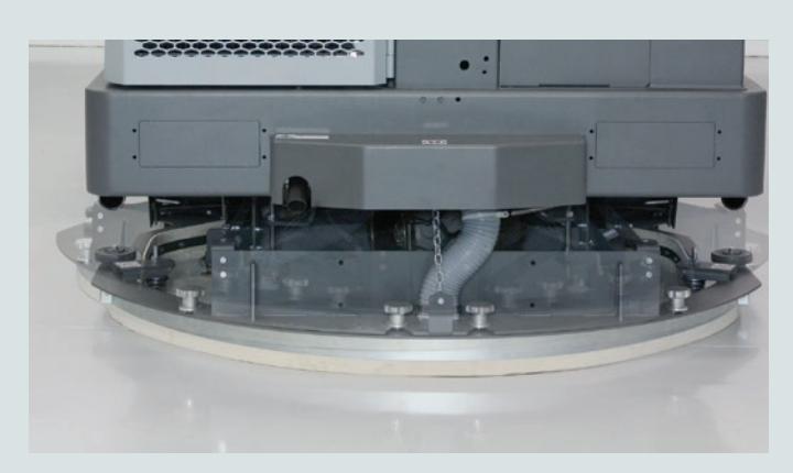
Patented Accu-Track™ squeegee provides superior water pick-up even during the tightest turns.