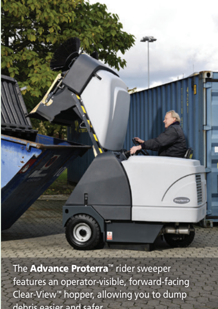
debris easier and safer.