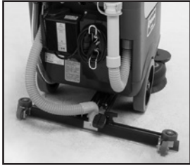
Center-pivot squeegee system employs a gas spring for maximum blade pressure to ensure complete dirty solution pickup in both forward and reverse.