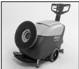
Brush stored on front for ease of transport.

Wrap-around ergonomic handle system provides operator comfort