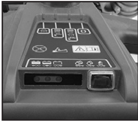
Electronic solution control for low, medium and high flow.