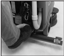
Foot-activated squeegee lift for easy operation.