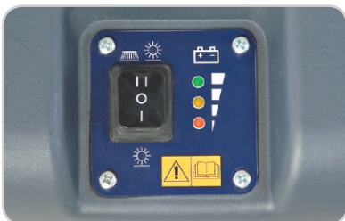
Two position, single button operation.