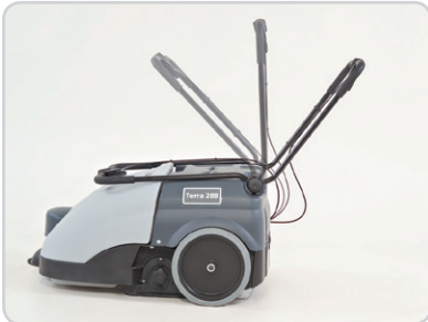
Adjustable handle folds for easy storage.