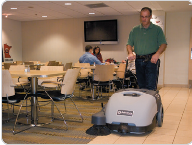
Terra® 28B easily cleans both hard and soft floors without having to change brooms.