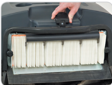
Filter shaker easily combs filter for cleaning. A well maintained filter will last for over 100 hours of operation.