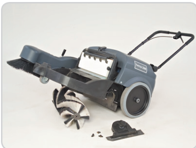
Tools-free removal of brooms and hopper makes for easy maintenance.