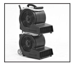
HydroDry™ blowers are designed to stack for storage, or to gang up for additional air flow.