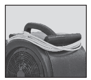
Molded-in cord wrap for easy storage of the 25 foot long safety yellow power cord.