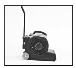
With the optional wheel/ handle kit multiple units can be easily transported.