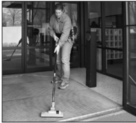
Combination floor tool is easy to use on hard or soft floors.