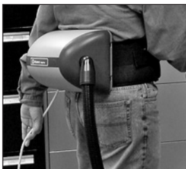
Padded belt is adjustable for operators comfort.