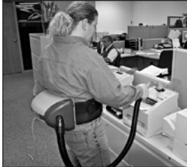
Detail cleaning on the go is easy with handy crevice tool and bristle brush.