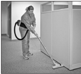
Edge cleaning is done easily with the Adgility™.